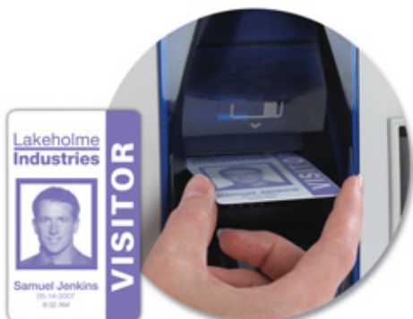
1. Insert the card