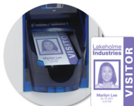
3. The rewritten card is available for use.