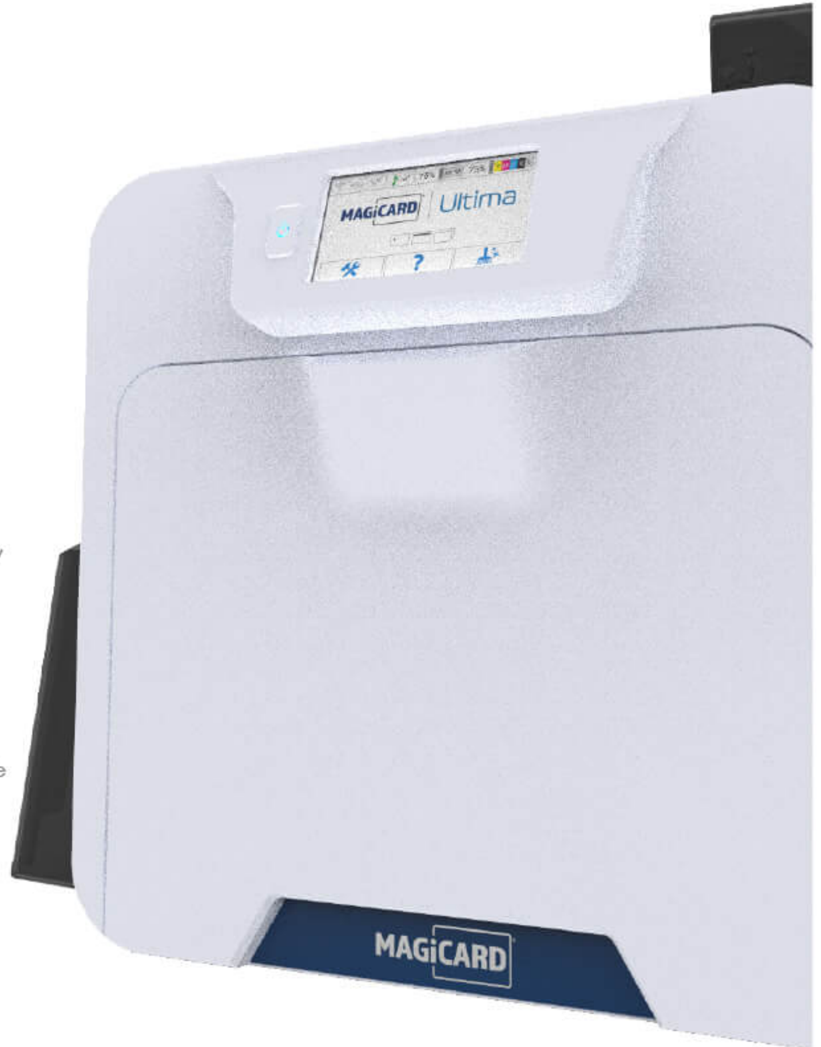
Photo-quality over-the-edge retransfer printing

Powered by a high-grade processing unit with an impressive array of features, the MagiCard Ultima is ideal for the localised or centralised issue of high-volumes of secure smart cards.