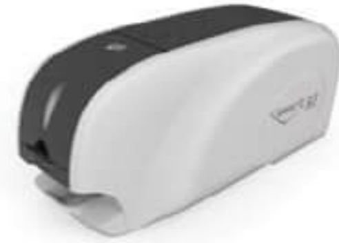
Rewritable ID CARD PRINTER smart-31 R