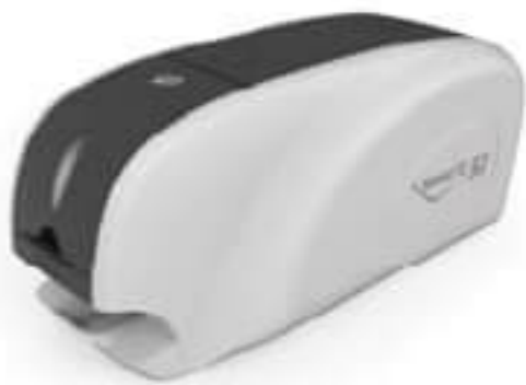
Single sided ID CARD PRINTER smart-31 S