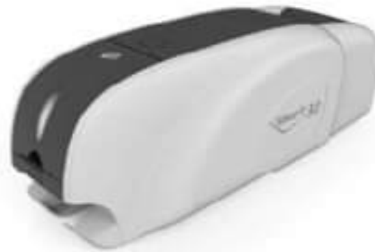
Dual sided ID CARD PRINTER smart-31 D