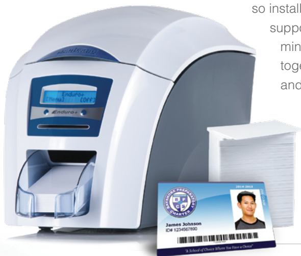
MAGICARD ENDURO+ ID CARD PRINTER

It wasn't just the installation that impressed her but AlphaCard's free ID card software training: "AlphaCard helped me set up the database fields, and showed me where each student image would go onto the card, so after that, we were good to go."